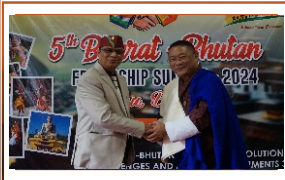
H.E. Lyonpo Sangay Khandu, Hon'ble Deputy Speaker NAB