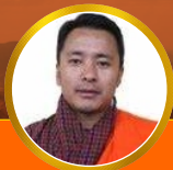
H.E. UGYEN DORJI