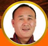
H.E. TENZIN LEKPHELL