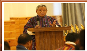
Hon'ble Lyonpo Dr. Kinzang Dorji Ex. Prime Minister of Bhutan