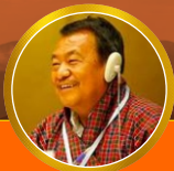
H.E. ZANGLAY DUKPA