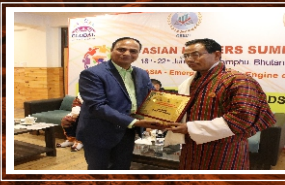
LYONPO Norbu Wangchuk Hon'ble Education Minister of Bhutan