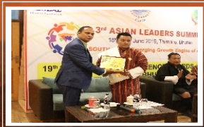
Lyonpo Ugyen Dorji, Hon'ble Labour Minister, Govt. of Bhutan