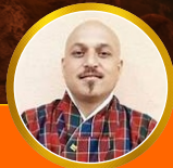
HON' BIRENDRA CHIMORIA