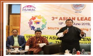
Dr. Zangley Dukpa, Hon'ble Health Minister of Bhutan