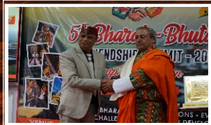
H.E. Lyonpo D. N. Dhungyel, Hon'ble Foreign Minister of Bhutan