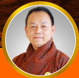
HON KAMAL BAHADUR GURUNG