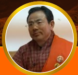
H.E. NORBU WANGCHUK