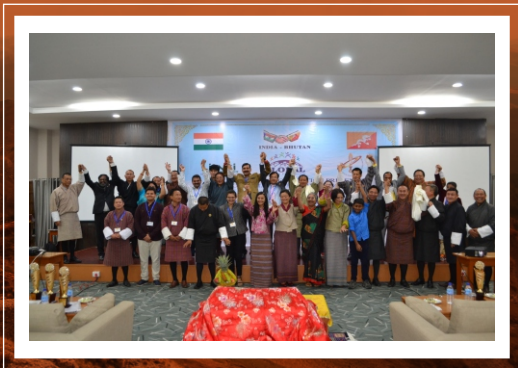
Joining Hands for Peace in South Asia