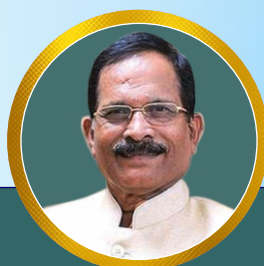
Shri Shripad Naik