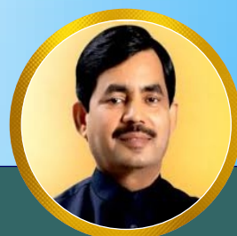
Syed Shahnawaz Hussain