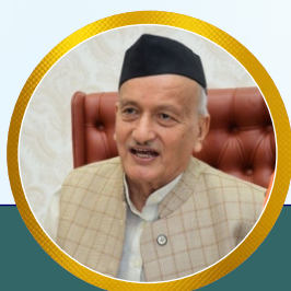
Shri Bhagat Singh Koshyari